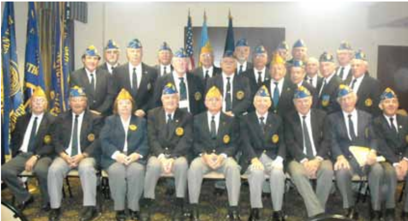
64th UAV Convention Delegates

After the banquet, the band Karpaty provided delightful musical entertainment. The 64th UAV National Convention ended on a high note, with fond farewells and promises to meet again at the next convention in Boston, MA.