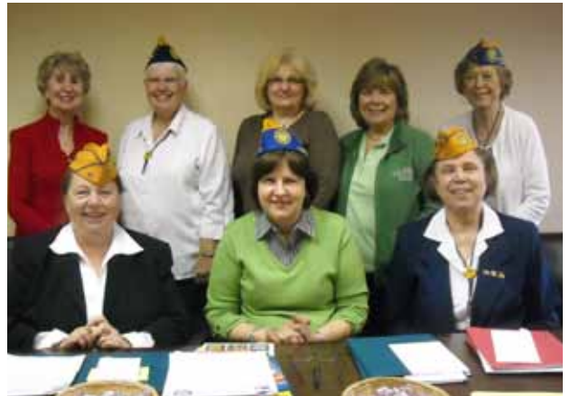
UAV NLA Delegates