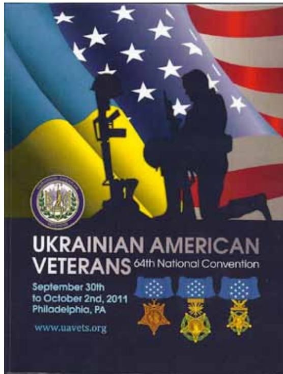
UAV 64th National Convention Journal