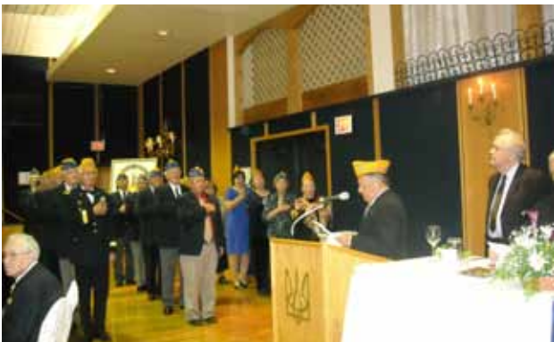
Installation of Officers