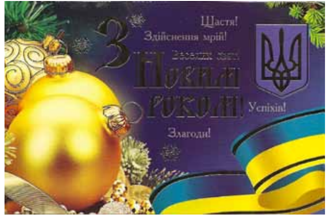
Christmas card from Ukraine