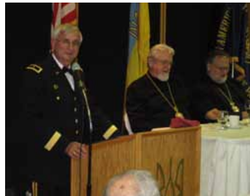
NC Kondratiuk, Archbishop Antony and Metropolitan Soroka