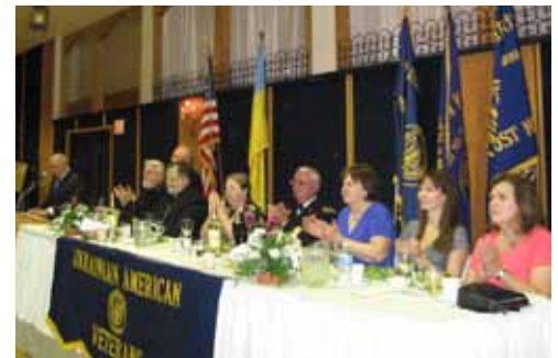
Honored Guests at the head table