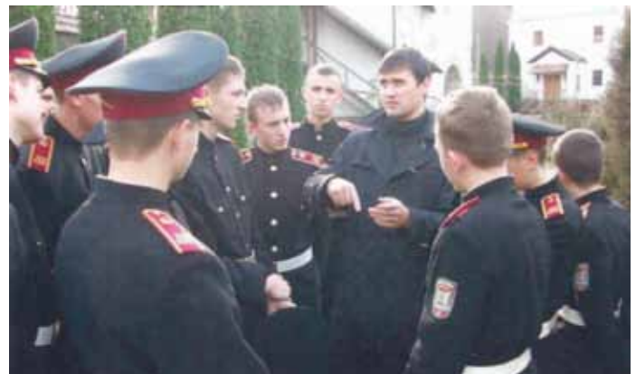
Seminarian with Lviv Military Academy Cadets